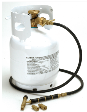
Tank sold separately